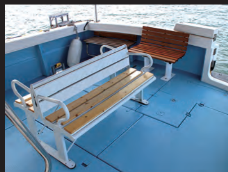
Kumamon Cruiser. Maximum capacity of 12 passengers.