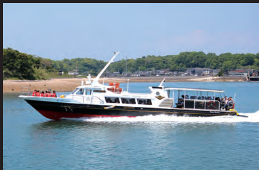
VistaBonita Maximum capacity of 88 passengers.